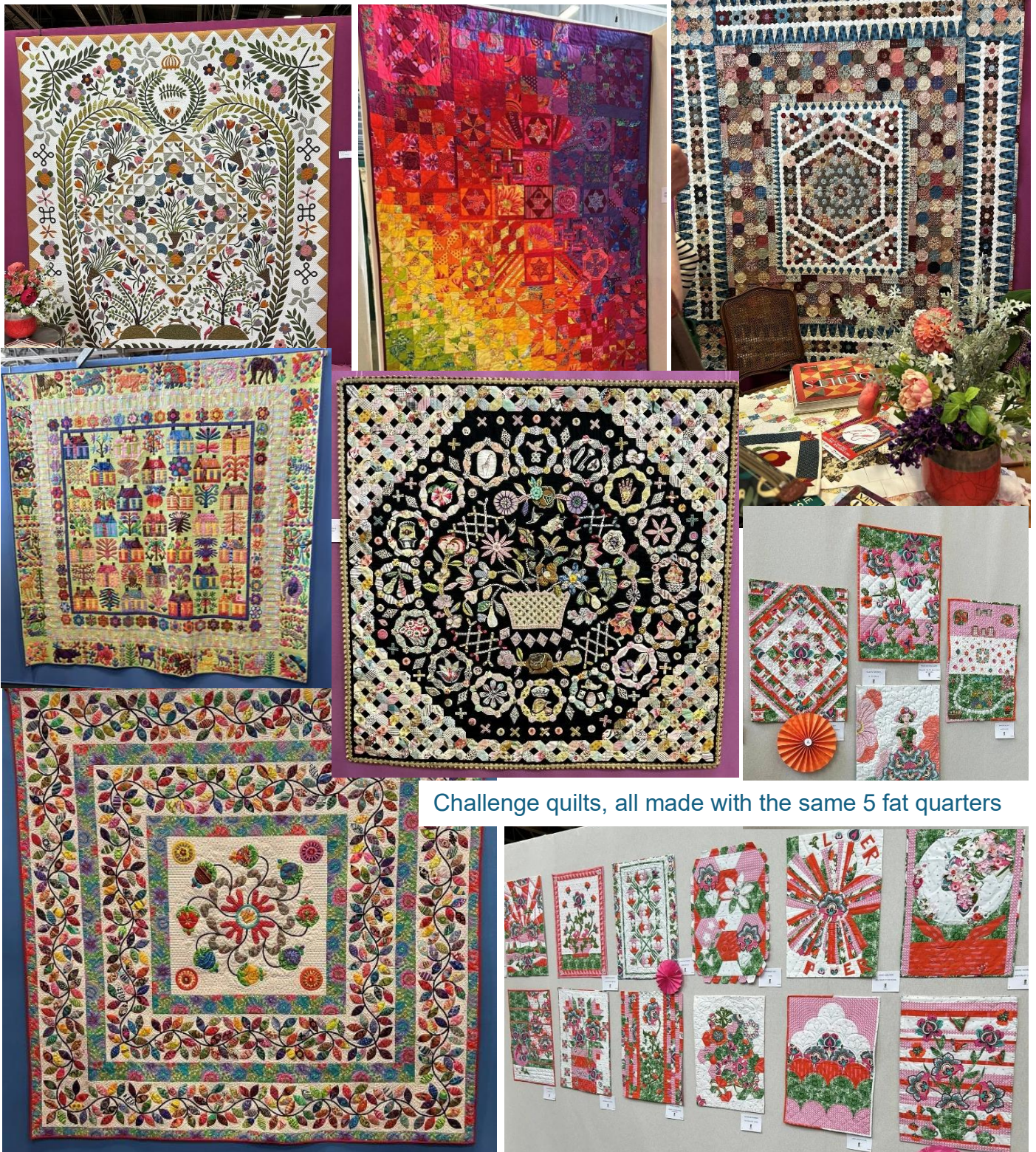
Challenge quilts, all made with the same 5 fat quarters