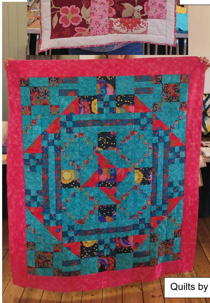
Quilts by Sheila