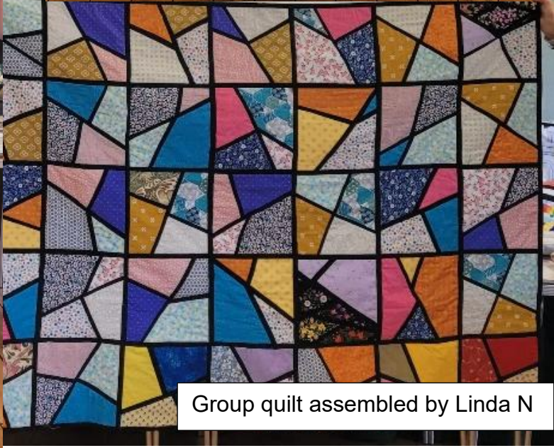
Group quilt assembled by Linda N