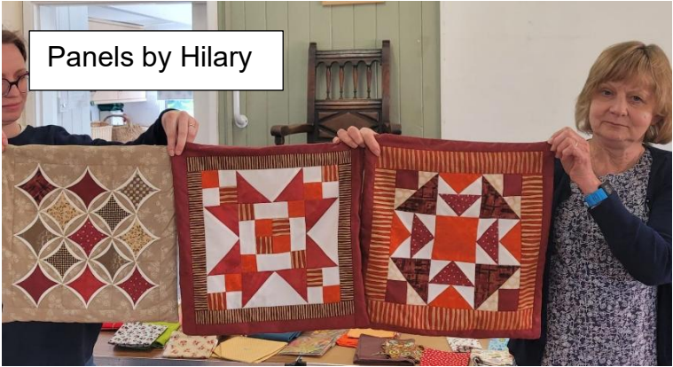
Panels by Hilary