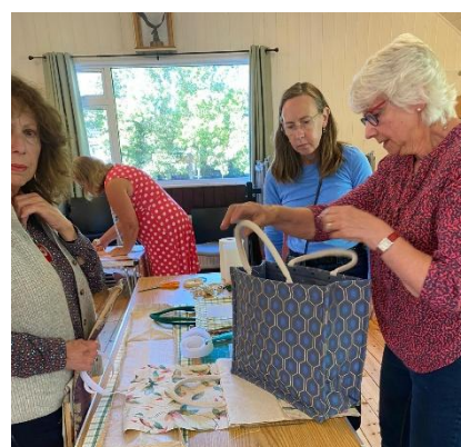
Other members made good progress with their hand sewing at the meeting