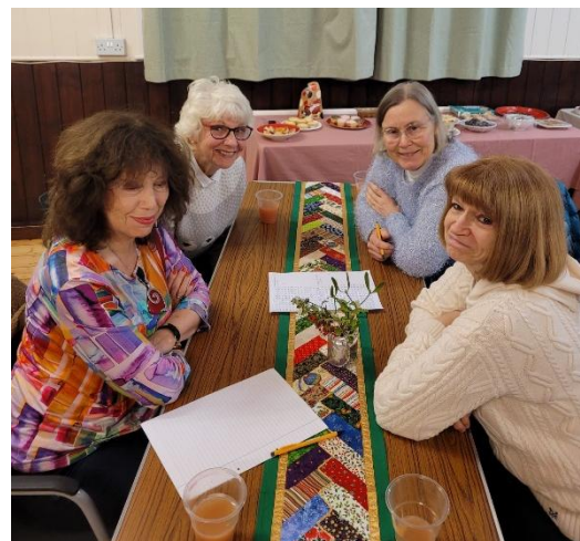
The winning wordsearch team!