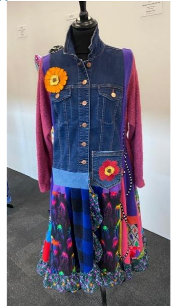
Francesca's favourite costume