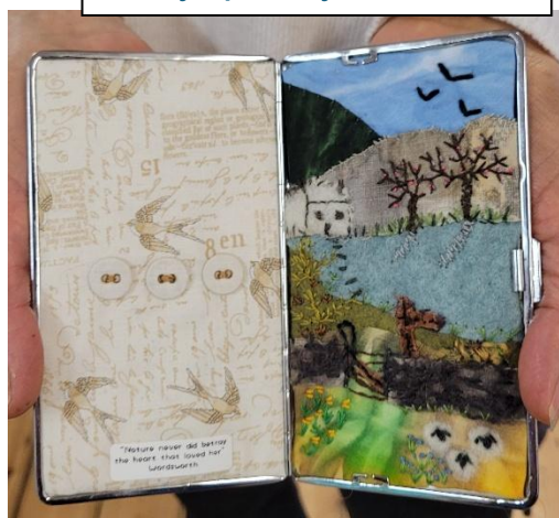
Scene in a cigarette case by Francesca