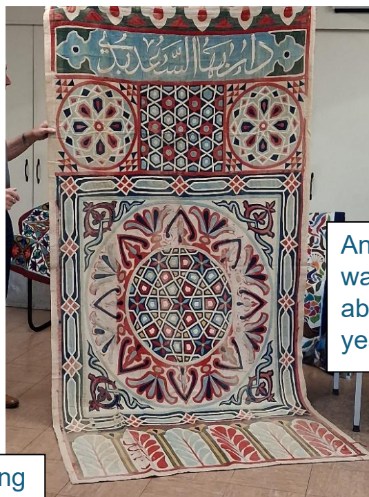
An Egyptian wall hanging about 100 years old