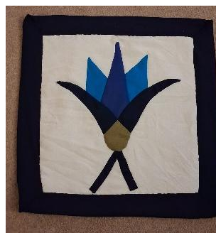
Starting and finishing point, Irene's lotus flower