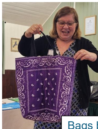
Bags by Ginny