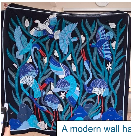
A modern wall hanging